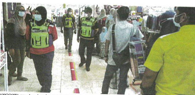
ANGGOTA pasukan keselamatan membuat rondaan pematuhan SOP Covid-19 di Klang, semalam.

"Daripada 28 kes penularan dalam negara, 19 kes