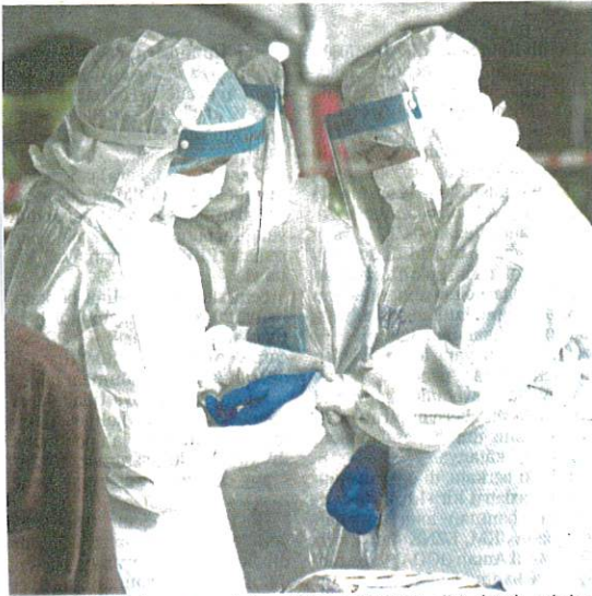
Pegawai kesihatan memakai pakaian pelindung diri (PPE) sebelum melakukan saringan COVID-19 di Hospital Alor Setar, semalam.