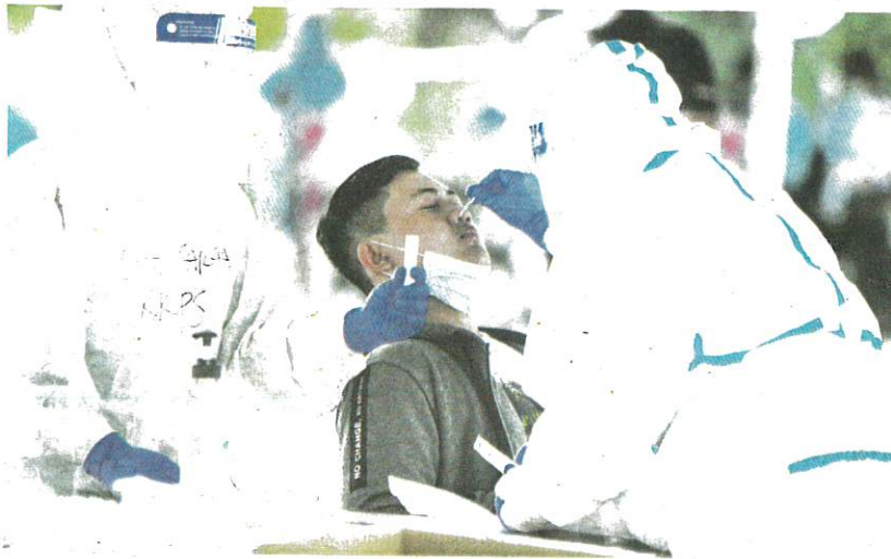
PETUGAS kesihatan sedang menjalani ujian saringan kepada seorang penduduk di Hospital Alor Setar semalam.

Beliau berkata, enam kes lain di Sabah adalah saringan berbeza yang antara lain melibatkan saringan warga emas di Klinik