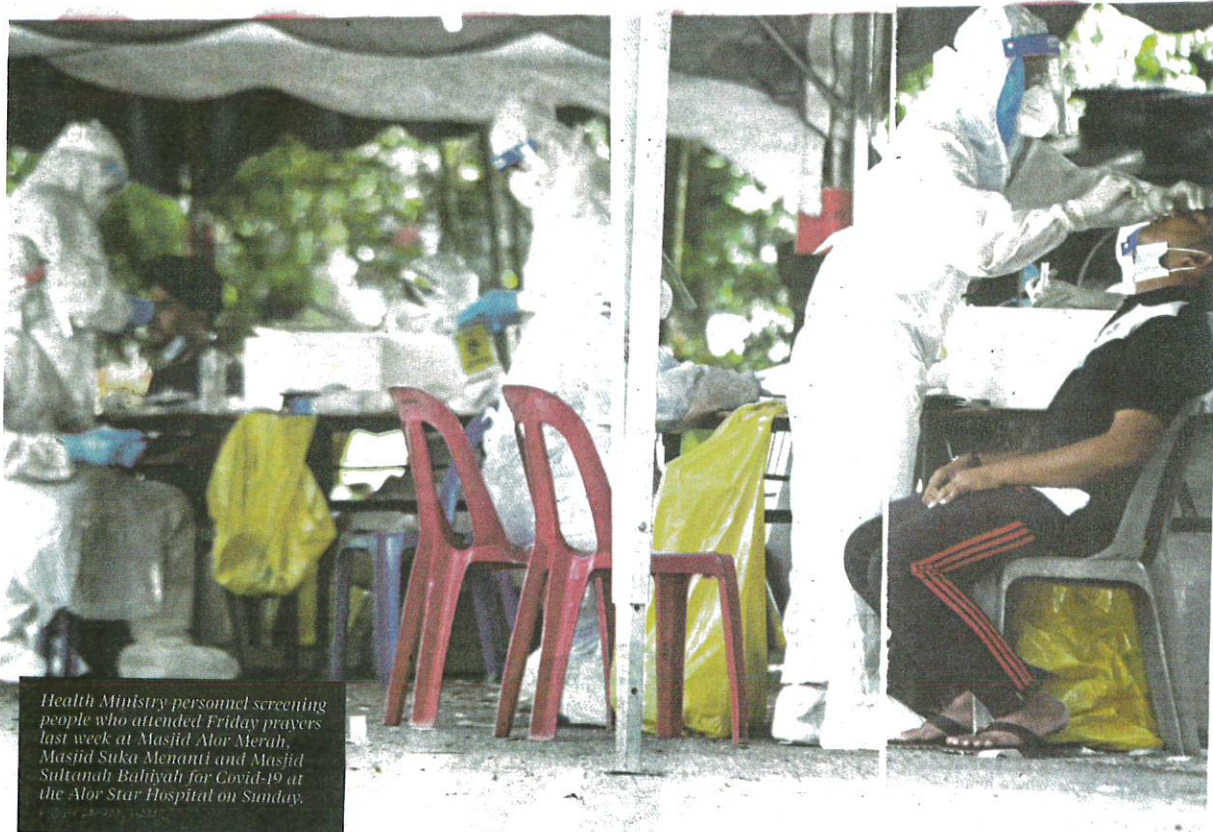
Health Ministry personnel screening people who attended Friday prayers last week at Masjid Alor Merah, Masjid Suka Menanti and Masjid Sultanah Bahiyah for Covid-19 at the Alor Star Hospital on Sunday.