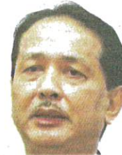
Dr Noor Hisham Abdullah

"Selain itu, satu kes dikesan dalam saringan kontak rapat bagi kes ke-9,454. Beliau ialah anak kepada kes ke-9,454 dan satu kes saringan tahanan di Ibu Pejabat